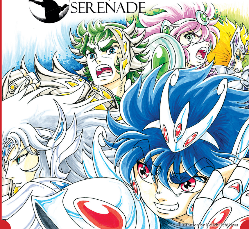
Illustration by Keiichi Ichikawa